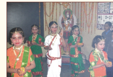
Saraswati Vandana at Diya Vidya Mandir