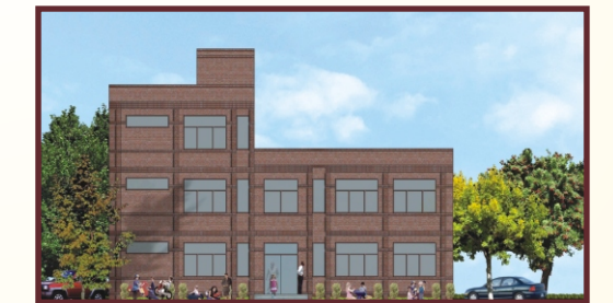
Proposed new school building

Construction of new school building of Chetan Public School, a school for underprivileged children, is now on a verge of completion on a land of 400 sq. yards in Nihal Vihar, New Delhi. The new school building which is very near to Diya Vidya Mandir, the existing school being run by Diya Foundation, will accommodate about 250 more students upto Class V. The school will have a Library and Computer Education Cell for providing quality education to the poor students of the area. It is also proposed to hold vocational training classes for women in the new school building after the school hours.