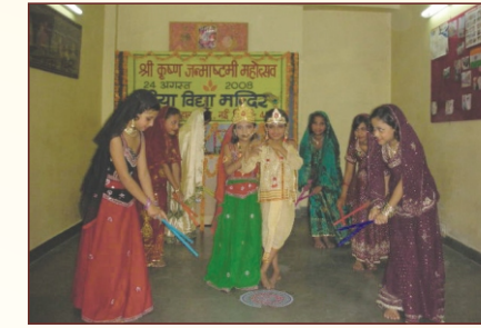
Enacting Rasleela on Janamashtmi