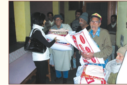
Bed sheets and pillows were distributed to the inmates of Old Age Home at Geeta Mandir, New Rajinder Nagar, New Delhi