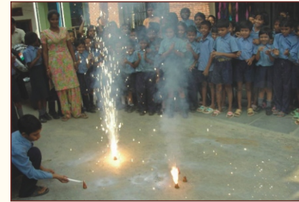
Children enjoying fireworks on Diwali