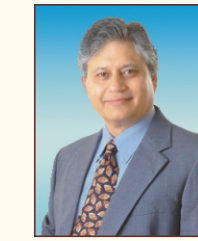
Mr. Shiv Khera

Shiv Khera is an educator, business consultant, and a renowned and sought-after speaker. He endeavors to encourage and inform people, helping them realize their true potential and has taken his dynamic message around the world.