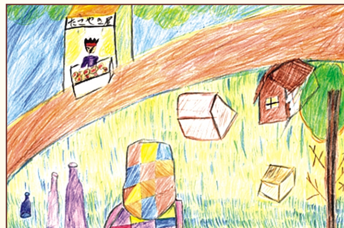
Painting by Sandeep, Age 7 years

"In helping others, we help ourselves, for whatever good we give out completes the circle and comes back to us."