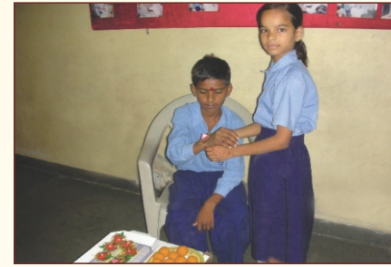
Rakshabandhan was celebrated at Diya Vidya Mandir, Nihal Vihar, New Delhi