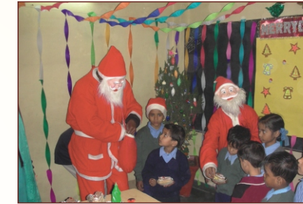
Christmas Day Celebrations