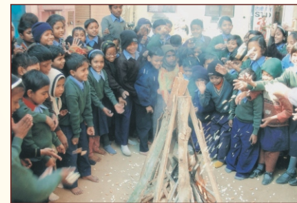
Children sang songs and danced around traditional bonfire to celebrate Lohri