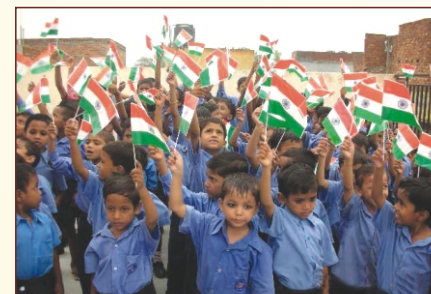
Republic Day Celebrations