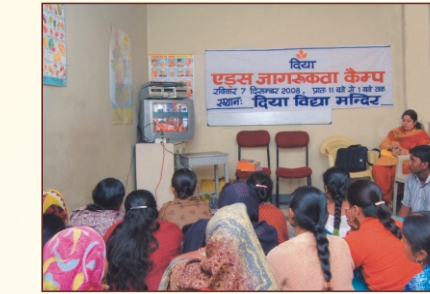
An AIDS awareness camp was held in Nihal Vihar, New Delhi